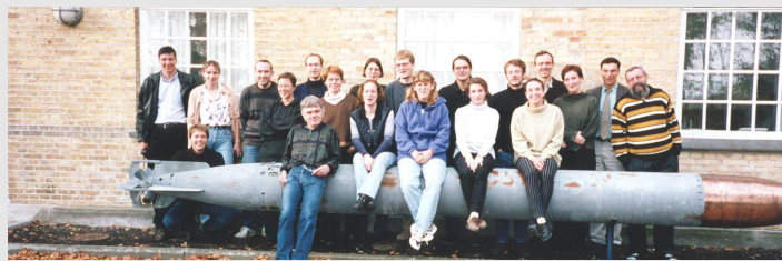
Participants of the 10th Novembertagung, 1999

For the 19th Novembertagung, Danish historians and philosophers of mathematics are proud to invite junior scholars with an interest in the history of mathematics to Søminestationen outside Holbæk, also the site of the 10th Novembertagung.